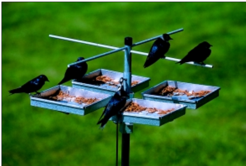
Hungry martins eating mealworms from a Bed & Breakfast platform feeder at the PMCA's Edinboro, PA, research site.

Cooked egg can be introduced once the martins have accepted insects. Eggs are easy to find and are much less expensive than insects. An added benefit to feeding eggs is the good supply of eggshells you'll have for the martins. Eggs require more preparation time than crickets or mealworms. The following recipe originated with Ed Donath of IL: Combine six large eggs and 1/4 cup of water; beat until well mixed. Microwave on high for 45 seconds, remove and stir well, then microwave for 45 seconds. Repeat until eggs are fluffy. Note: if the martins are feeding nestlings, do NOT add water to the egg, as it will make nest sanitation more difficult for the parents. Break cooked egg into 1/8"-3/16" pieces. Cool before serving. Cooked egg will keep in the refrigerator for 2-3 days, but uneaten food in the feeder will spoil, so replace it daily.